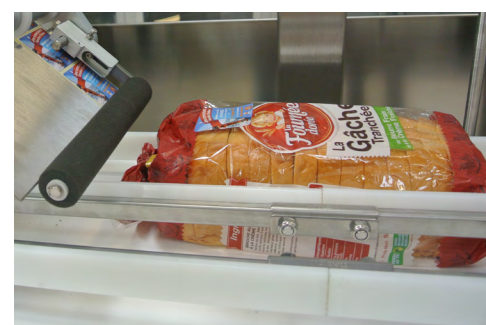
Product format 2

The system applies top labels to two different types of products (packages of sliced bread and hamburgers, even of different formats) simultaneously thanks to a single-belt conveyor split into two lanes. Two ALritma M labelling heads (for labels up to 200 mm in width) are installed for each section, managed by a non-stop control system which allows continuous labelling of products. When the control system detects the end of the label reel on the first labelling head, it disables it and activates the next one, allowing reloading to be performed without having to stop the labelling process. The same logic is also used on the other section, as the two non-stop systems are independent. Everything is managed via a 9" mobile touchscreen panel, which offers an excellent compromise between size and legibility.