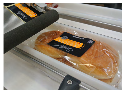
Product format 1